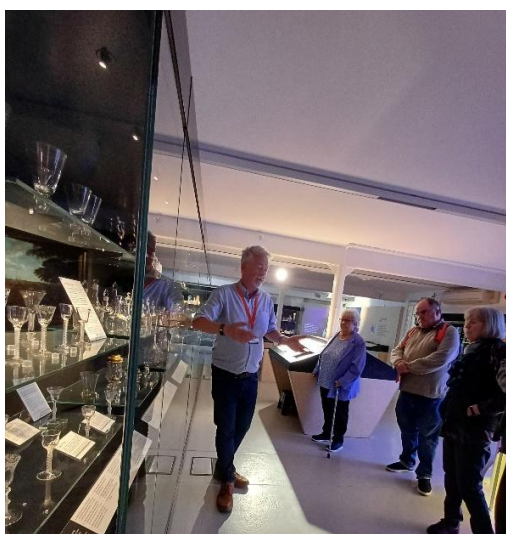
June '25 Guided tour of the glass museum