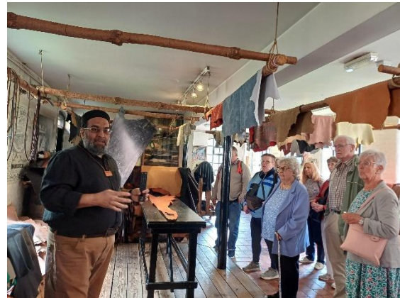
May '25 Walsall Leather Museum

At the Leather Museum, the guide explained why Walsall became the centre of the leather trade in this country. The guide demonstrated the saddle making processes that earned the town it's nickname 'The Saddlers'. The group learned about various skins and how they are processed into leather.