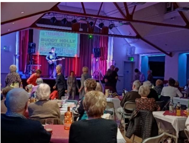
February '25 Buddy Holly Tribute & 50's Rock & Roll