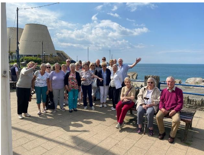
May '25 Short Break to Ilfracombe

The Glass Museum is located inside a glass cone and highlights the history of glass making in Stourbridge. It features a vast collection from the globally significant Stourbridge Glass Collection. The experienced guide walked the group through the galleries, highlighting the gems in the vast array of historical glass, from ancient Egypt to the Cameo glass that made Stourbridge famous throughout the world. The group watched an amazing and contemporary artist demonstrate glass blowing and viewed some of the artist's work.